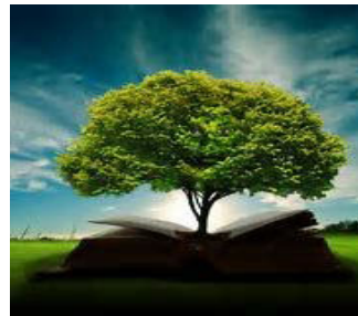
The Tree of Knowledge - symbolizing the Surpassing Knowledge of Christ

Paul who, having studied under Gamaliel - the very best in his days, was quite knowledgeable in worldly terms, concluded that all of his acquired knowledge was dung compared to the knowledge of Christ! It